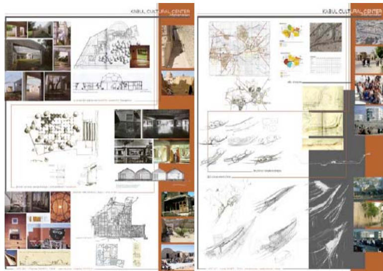
Figure 1 [3]